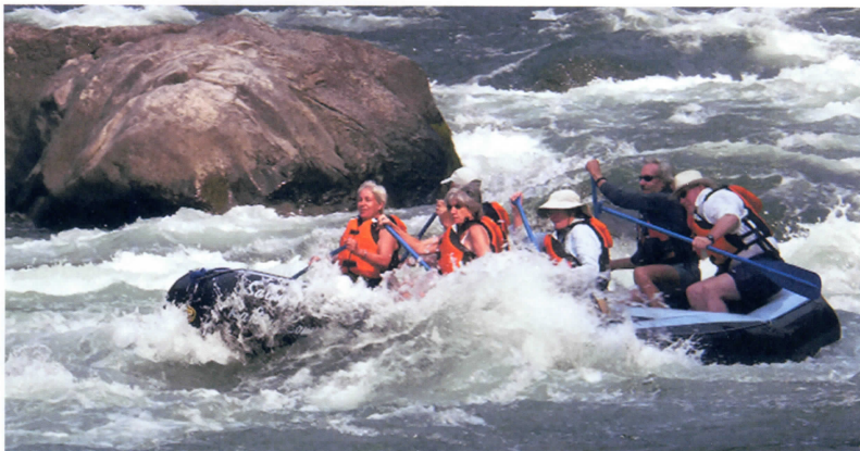
Paddle rafts provide a group participatory experience.