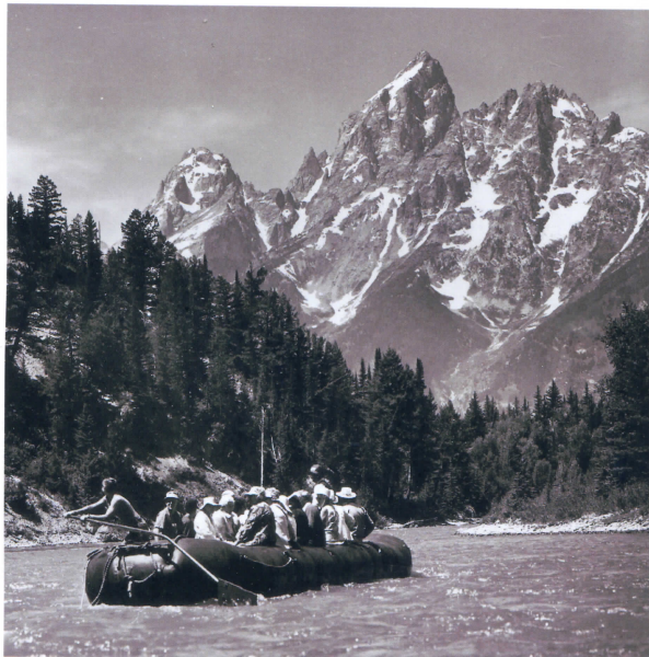
War surplus sweep pontoon on the Snake River- 1960s.

The changes in clientele over this period relate more to the experiences they seek, and outfitters have adapted their operations to accommodate this change. Gradually, the portion of the public with sufficient