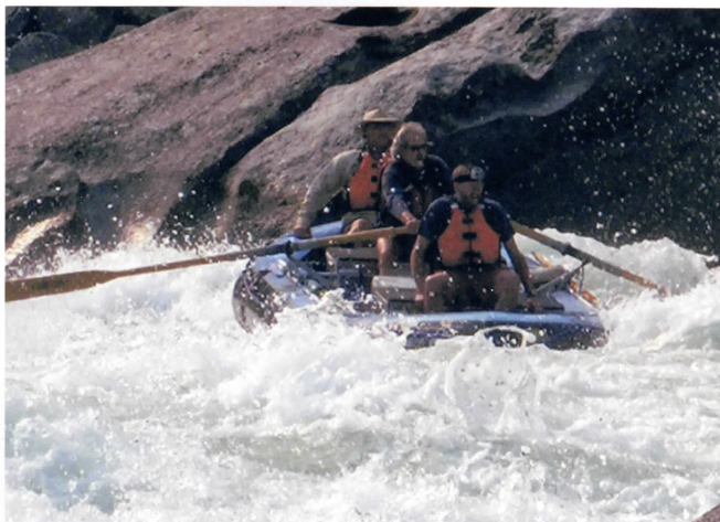
Rafts steered by a guide with oars offer the small boat experience without the responsibility for navigating the rapids.

After fifty years of running rivers all around the country, it is perhaps not surprising that a person would contemplate the future and consider a possible exit strategy from such a career. In fact, a number of former clients have inquired how long I plan to continue offering trips on the Salmon River. I assume that as a septuagenarian it may be presumed that I'm "circling the drain" (to use a water metaphor). Baring an unexpected health issue or injury I anticipate continuing to offer the Salmon River Lodge Accommodation trips for the near future. I'm still having fun.