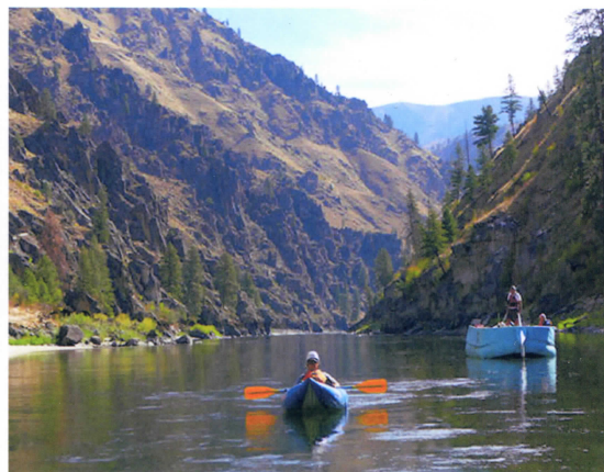
Calm water near the end of the trip.