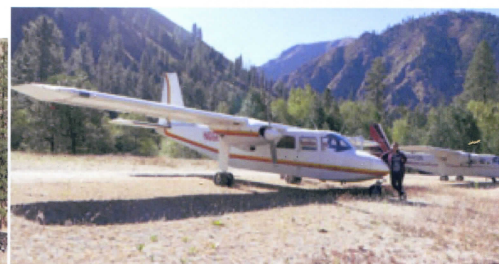
Two twin engine Islanders provide a scenic view of the Wilderness as well as egress from the canyon.