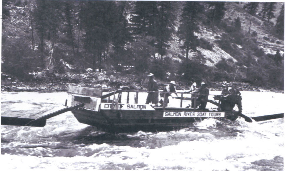
Wooden sweep boat on the Salmon River- 1940s.

Fifty years ago most rafts commonly utilized for commercial rafting were war surplus survival or assault rafts and inflatable bridge pontoons. Prior to the availability of these military craft the industry relied primarily on wooden boats of various designs depending on the water type, purpose of the trip, and/or clientele or cargo to be transported. The military surplus inflatable craft were considered “high tech” when I began guiding on the Snake