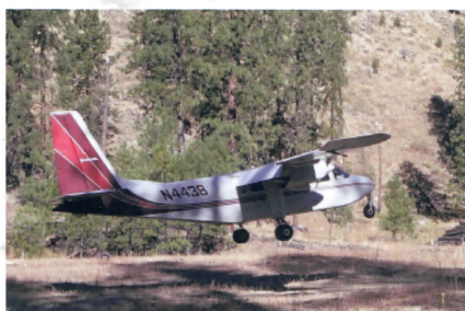
Planes arrive for our return to Salmon.