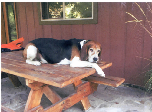
Mackay Bar Lodge's guest greeter seems excited by our arrival.