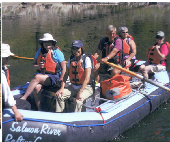
River guide's fantasy- a boat load of women