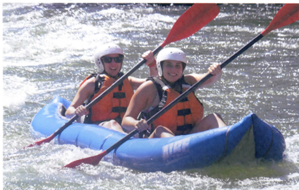
The inflatable kayaks provide a more intimate personal relationship with the river.