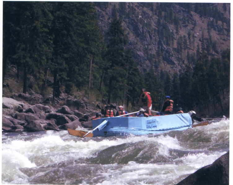
Our custom built sweep boat on the Salmon River.