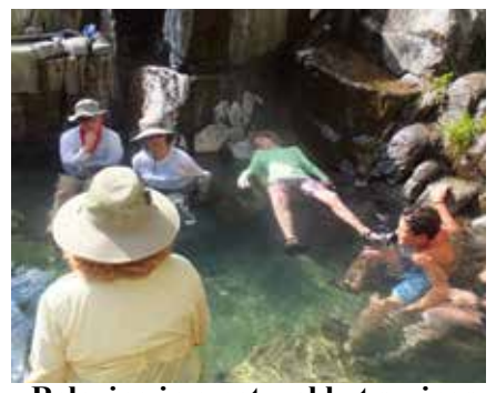
Relaxing in a natural hot springs