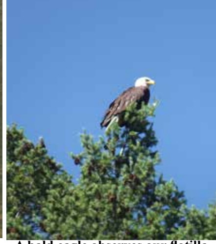
A bald eagle observes our flotilla