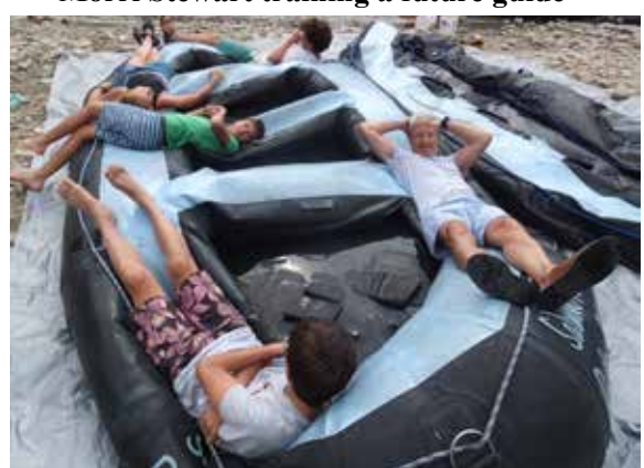
Trip participants help deflate the rafts at the end of the trip