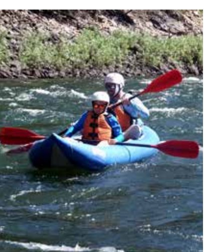
Father - son kayak team