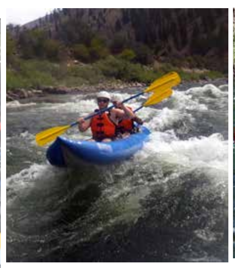
Another rapid successfully run