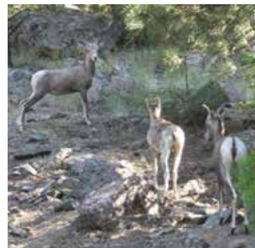
Rocky Mountain Big Horn sheep