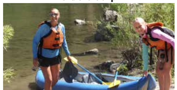
Mother - daughter kayak team