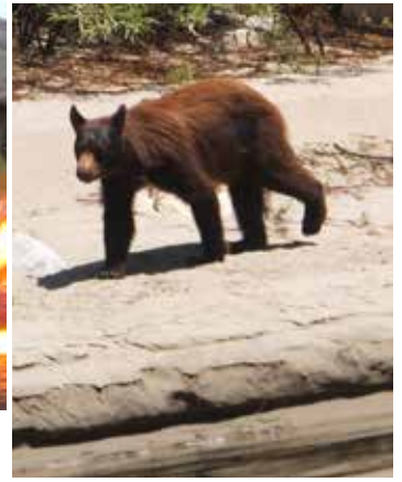
A black bear paces our downstream progress.