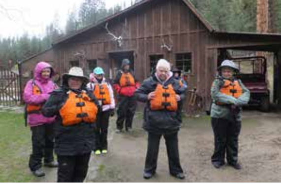
The Texas Ladies dressed for cool and wet weather in April.