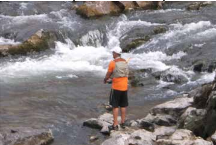
Fishing at Lemhi Creek