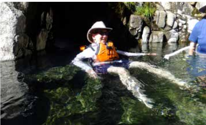
Soaking in the hot springs.