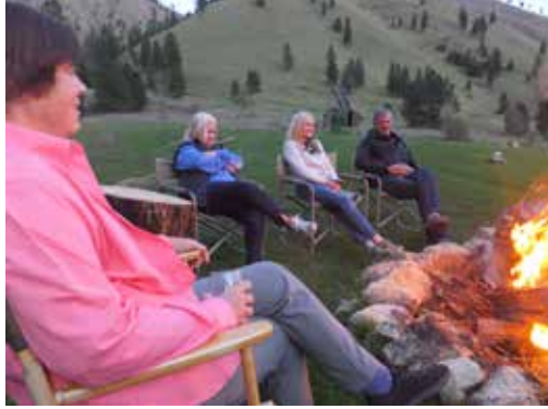
Enjoying the campfire in late afternoon at the Ram House.