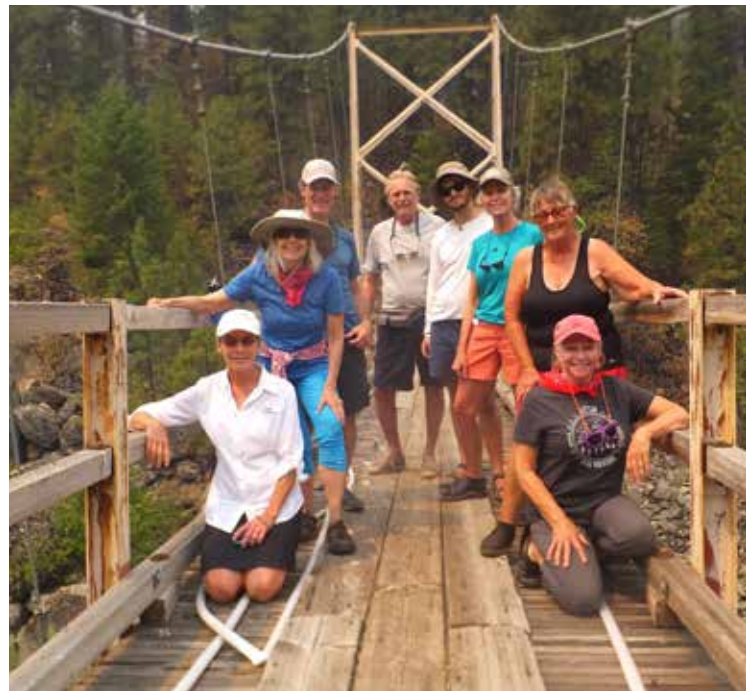
The July 20th rafting crew.