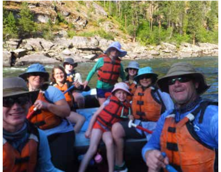
A boat full of happy rafters.