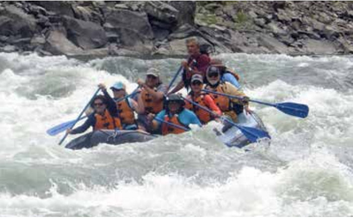
Paddling hard in Alder Creek Rapid.